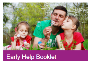
Early Help Booklet

Early Help in Worcestershire have created a booklet to help families find out about the help and support available in the county for children and young people aged 0-18 years old. The new booklet will help you and families find the most appropriate support.